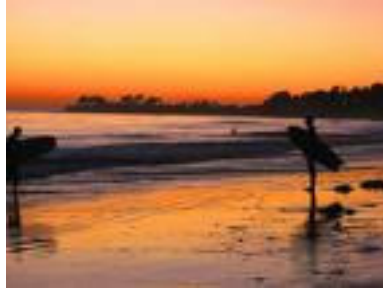
It's not all hard work...

Now picture yourself doing this every day for the next year – less days off for holidays, when your business will continue to earn money on virtual autopilot! Imagine a system that automates your business so you can walk away, go on a holiday or business trip, and yet still generate money around the clock.