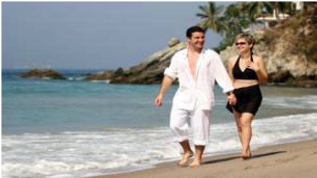
Walk away, go on a holiday